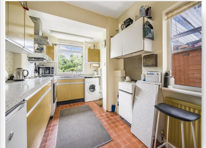
Queens Avenue, London N20 0JB