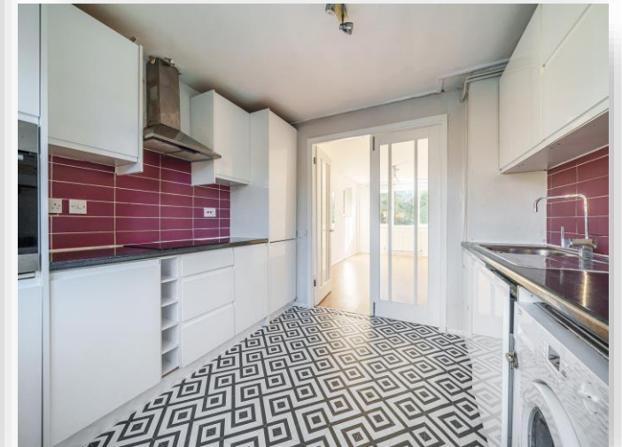
Capel Close, London N20 0QU