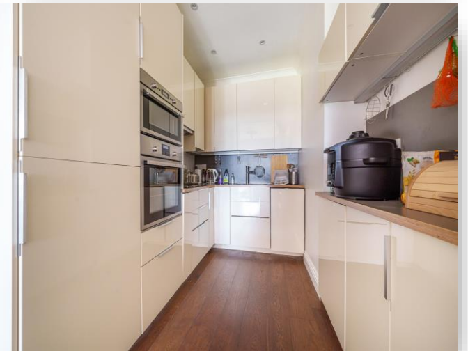
Eliot House High Road, London N20 9RT