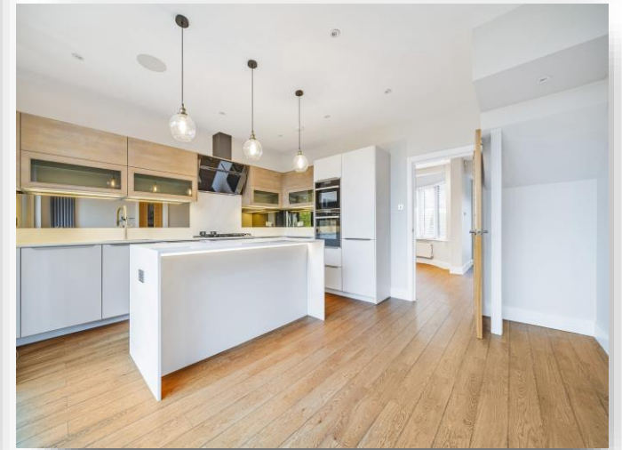
Gallants Farm Road, Barnet EN4 8ET