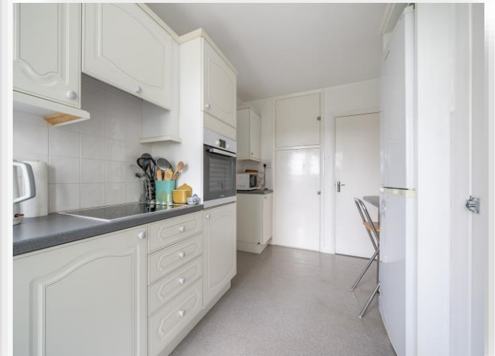
Pangbourne Court High Road, London N20 9PN