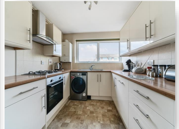
Barrydene Oakleigh Road North, London N20 9HG