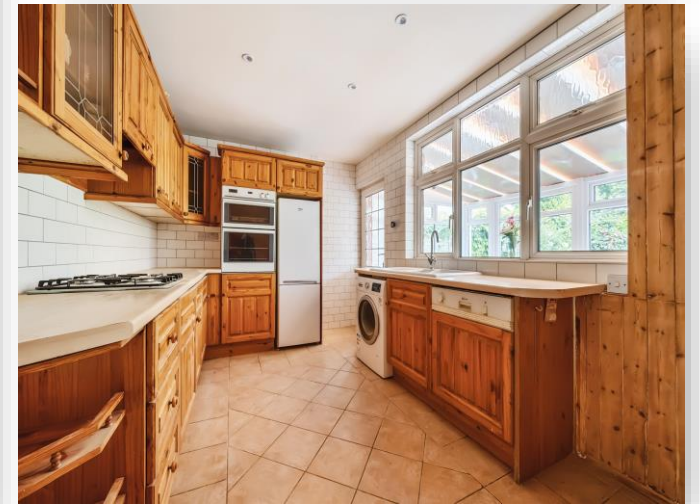
Raleigh Drive, London N20 0XA