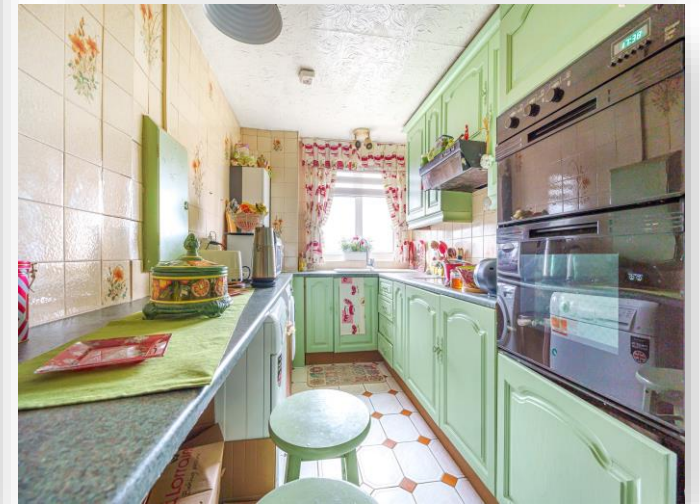
Marshe Close, Potters Bar EN6 5NR