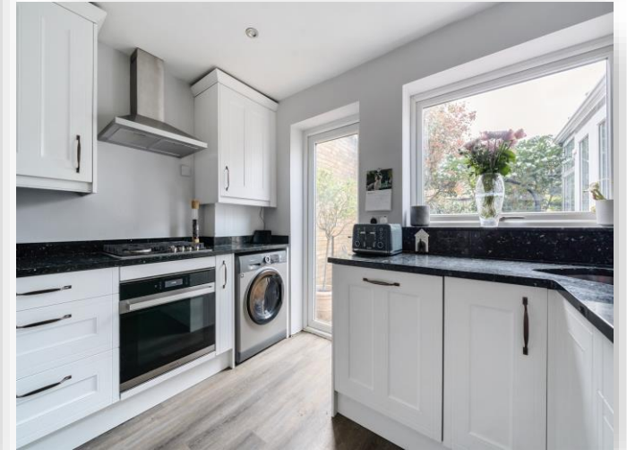
Trewenna Drive, Potters Bar EN6 5JL