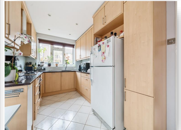
Eversleigh Road, Barnet EN5 1NE