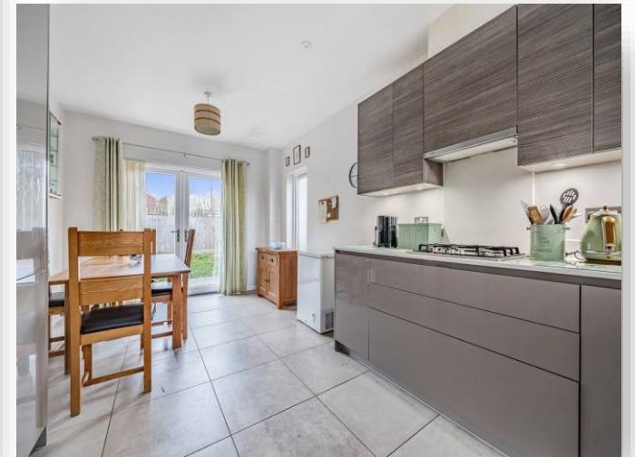
Sphinx Way, Barnet, EN5 2FG