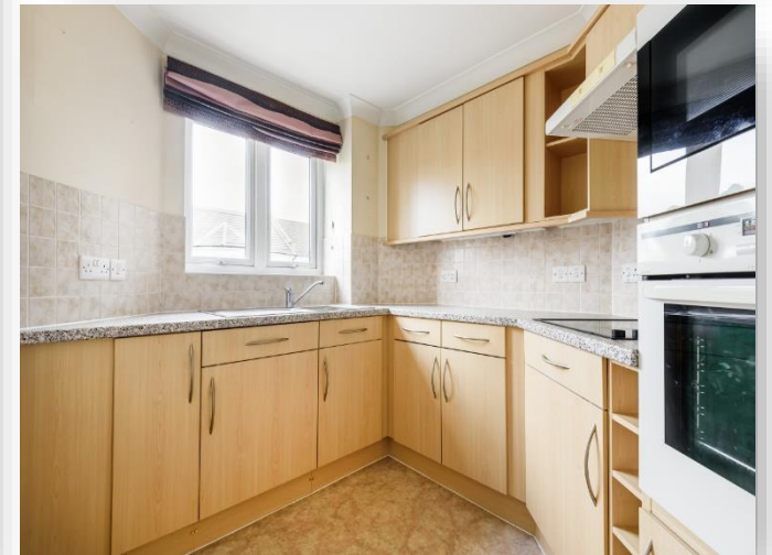
Argent Court Leicester Road Barnet EN5 5FL