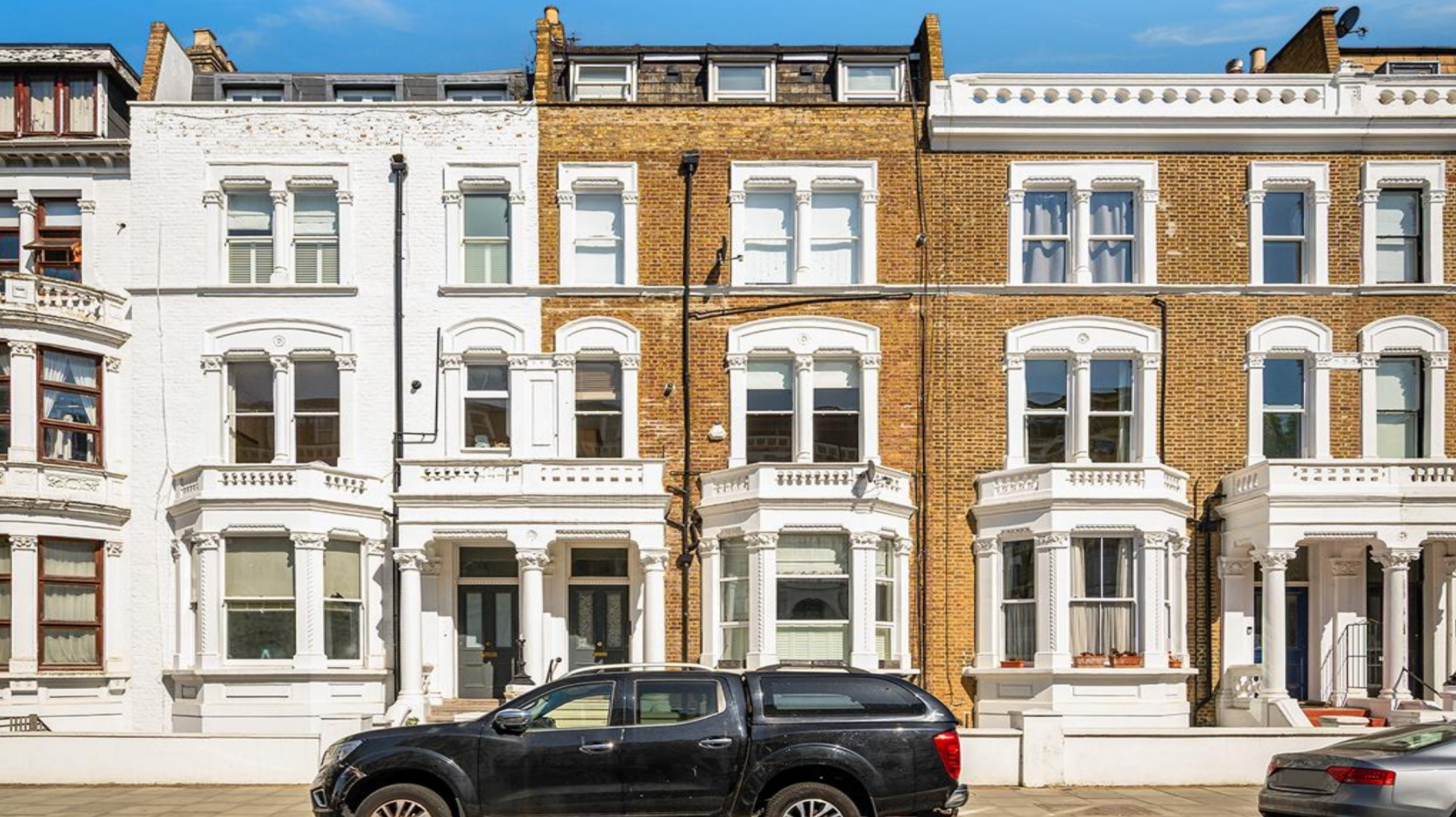
Sinclair Road, London W14 0NJ