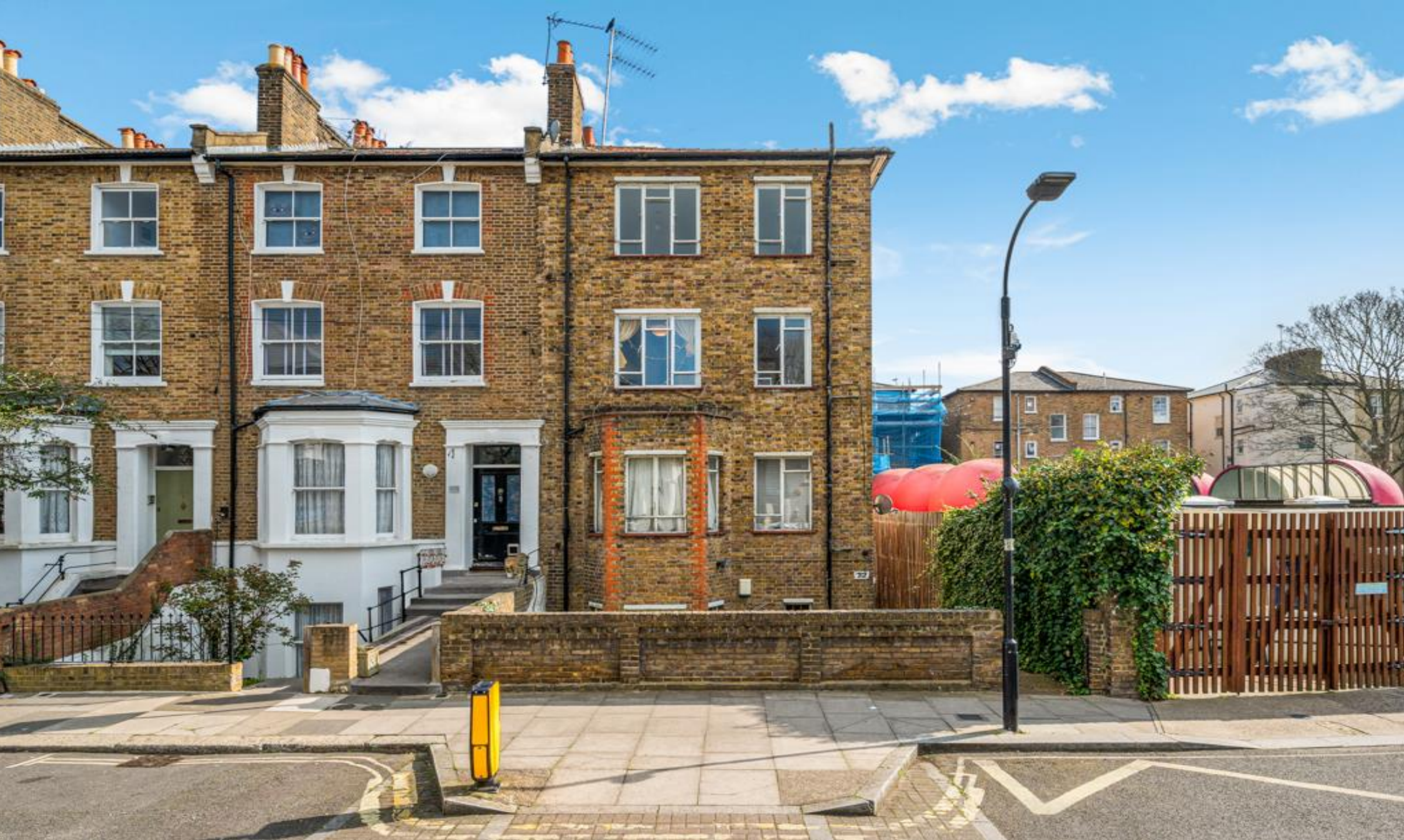
Cathnor Road, London W12 9JA