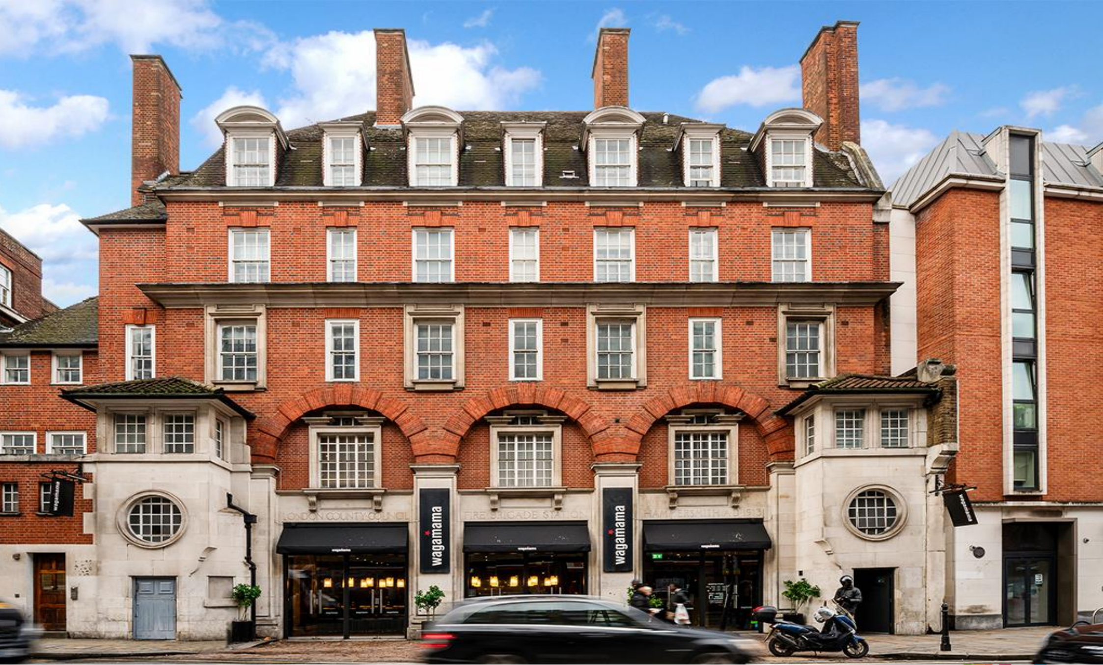
The Old Fire Station, Shepherds Bush Road, London, W6 7NN