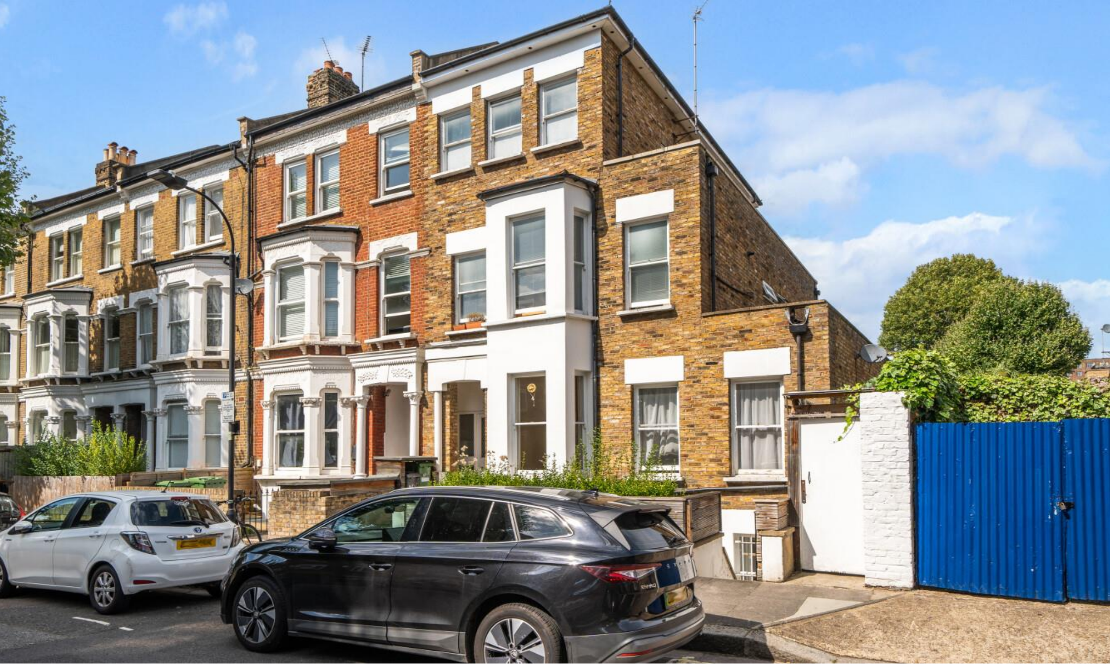
Melrose Gardens, London W6 7RW