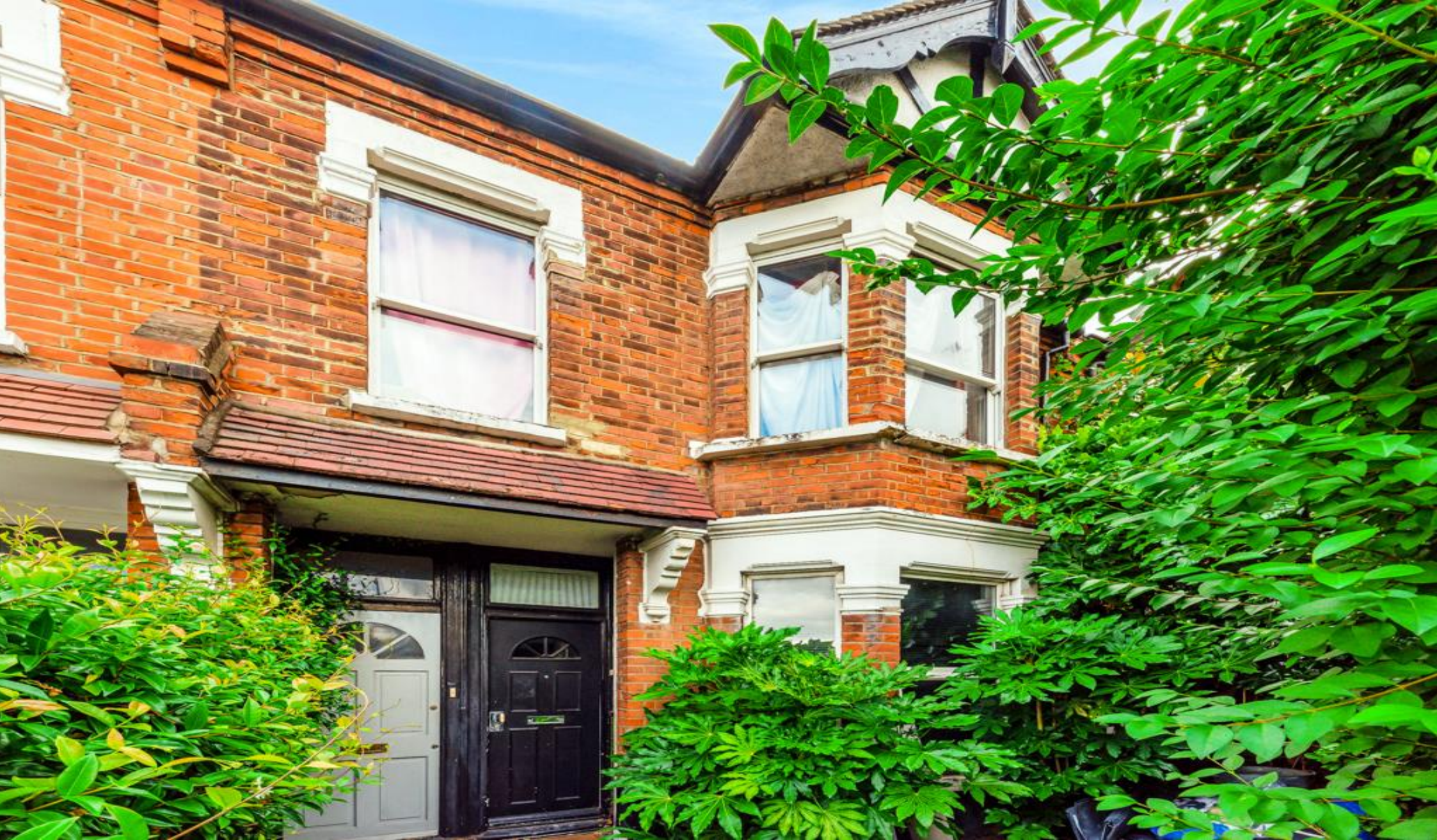
Pavilion Terrace, London W12 0HT