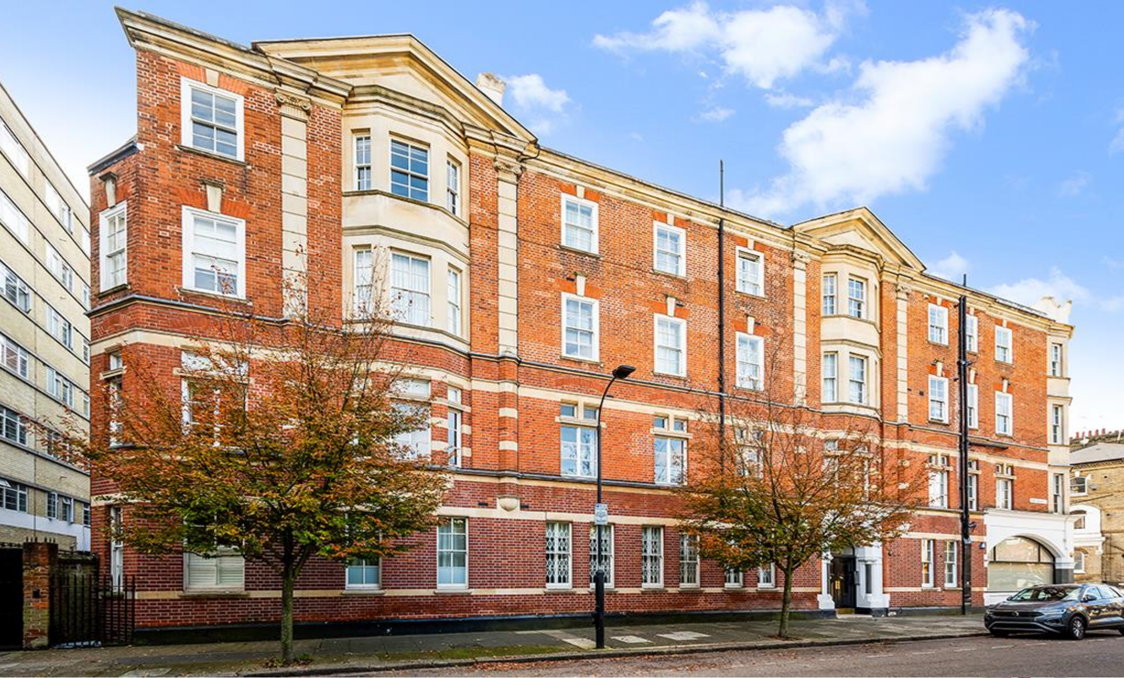
Wellesley Mansions Edith Villas, London W14 9AH