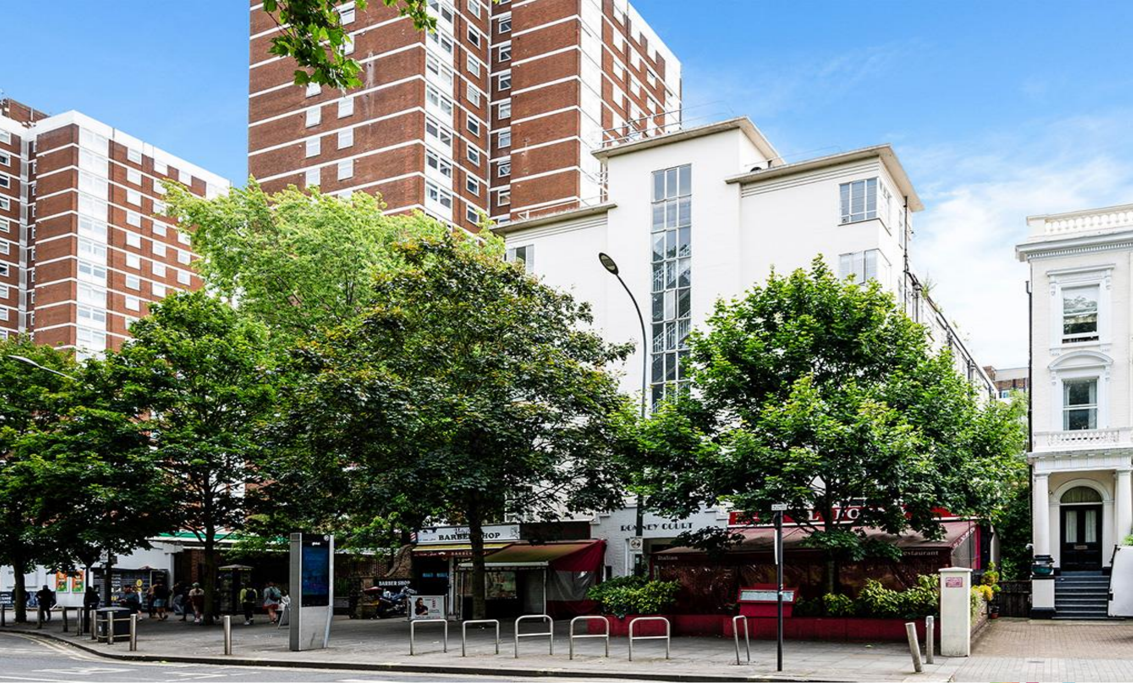
Romney Court, Shepherd's Bush Green, London, W12 8PY