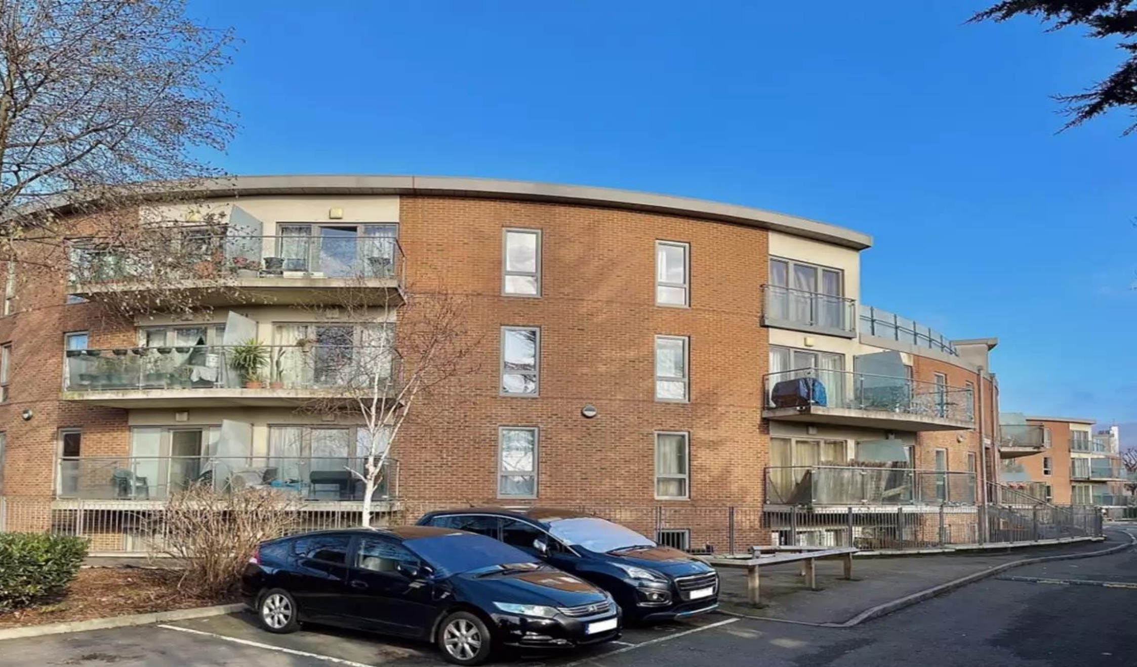
Banstead Court, Westway, London W12 0QJ