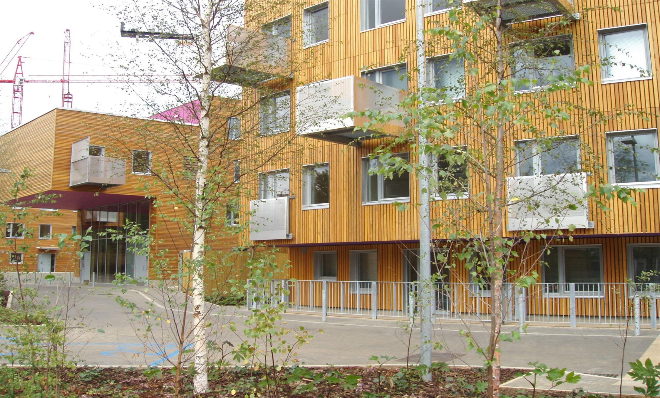
Normandy Place, London W12 8AX