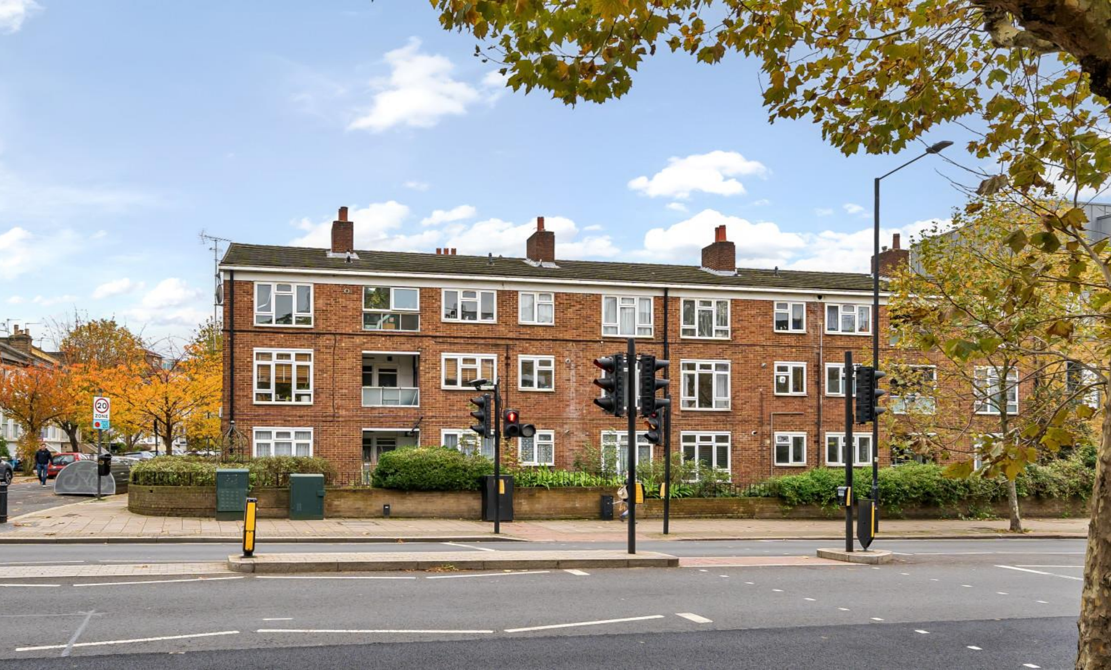
Charcroft Court, Minford Gardens, London W14 0BX