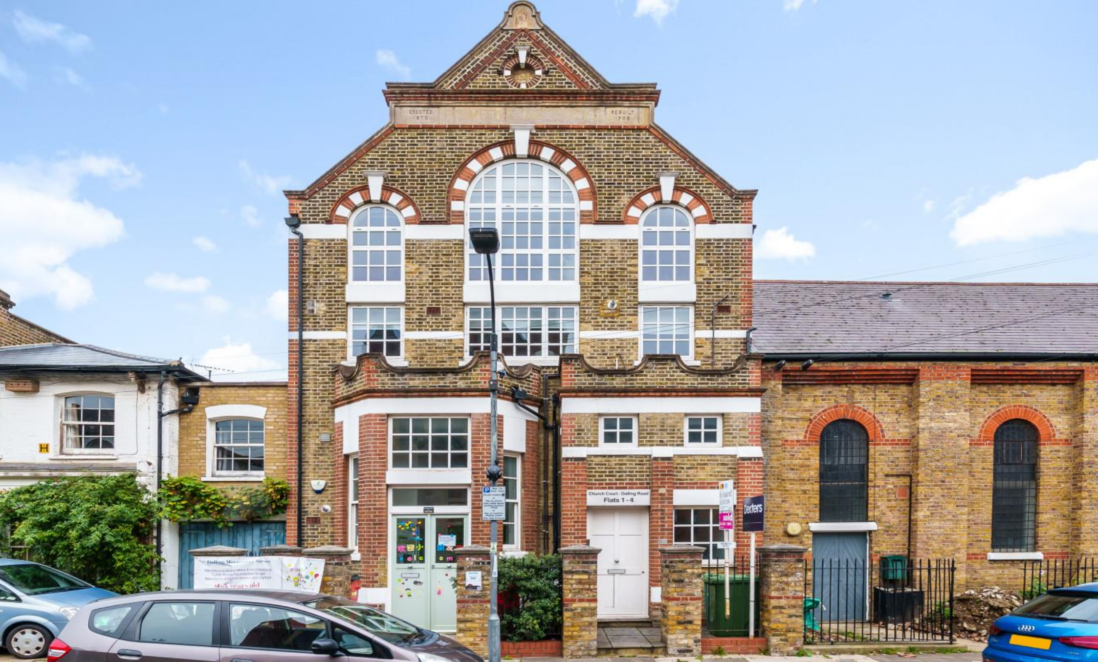
Church Court, Dalling Road, London W6 0EU