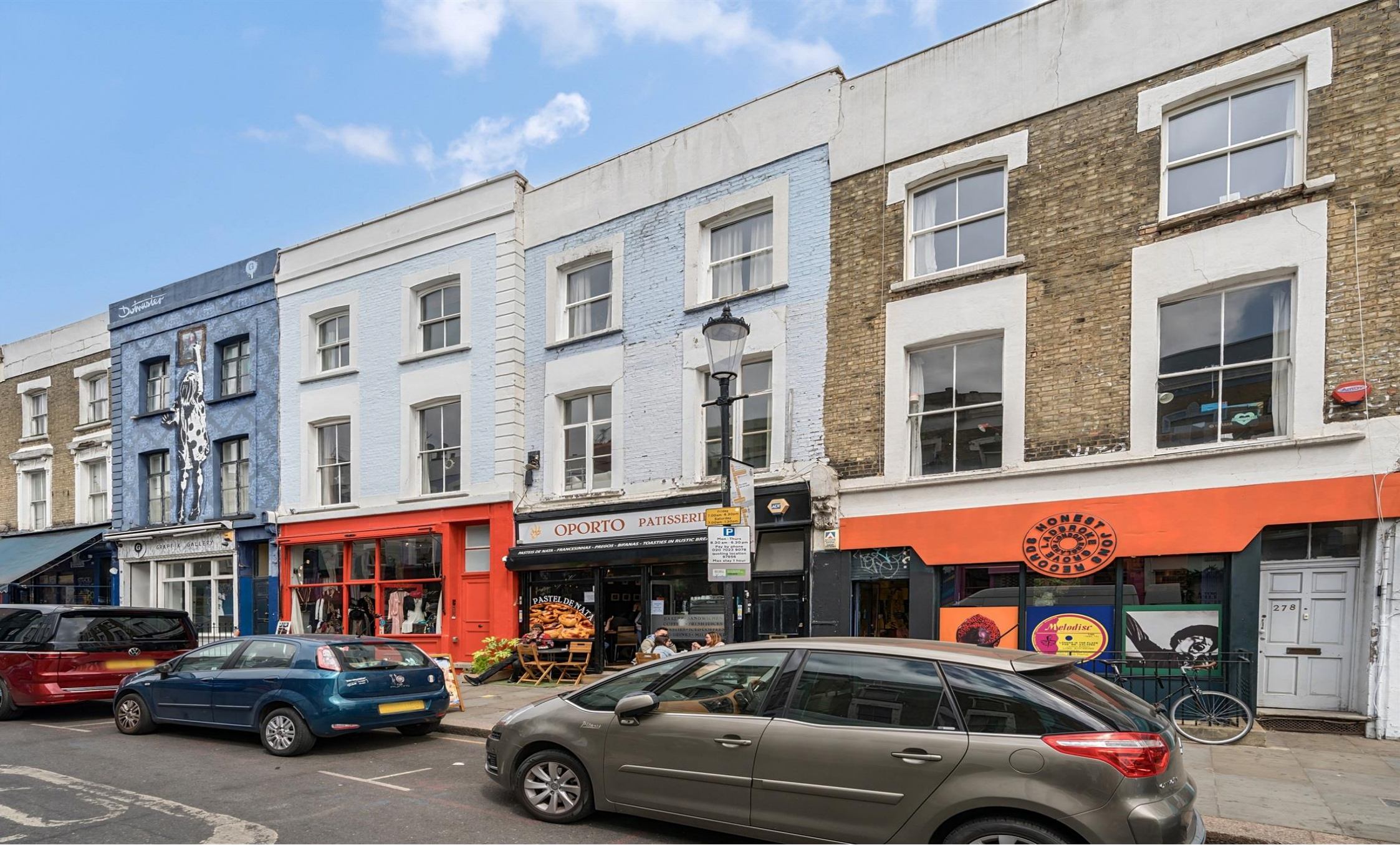
Portobello Road, London W10 5TE