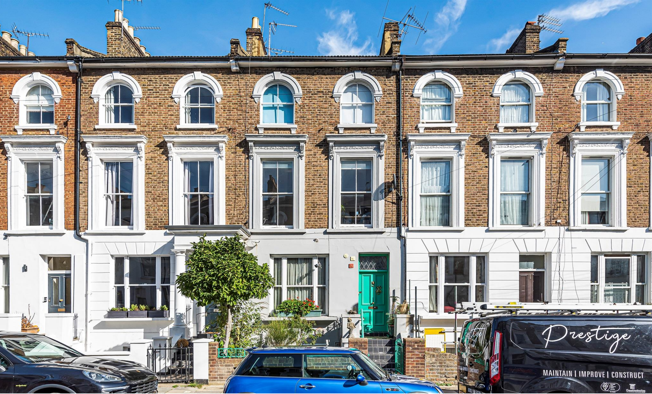
Woodstock Grove, London W12 8LE