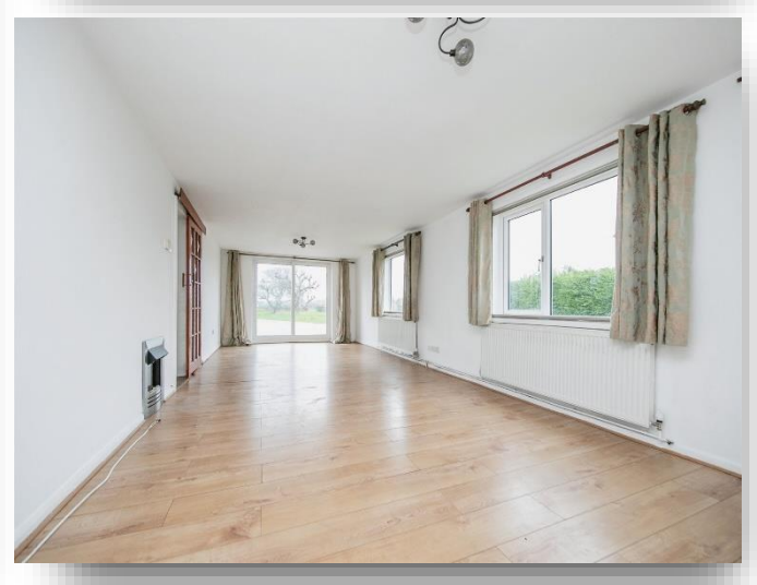
Glebe Cottage, Little Bromley Road, Ardleigh, Colchester, CO7 7NQ