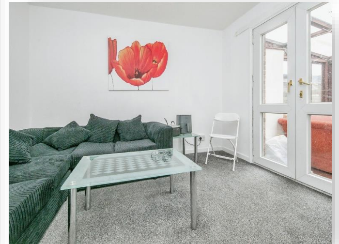
Holborough Close, Colchester, CO4 3LY