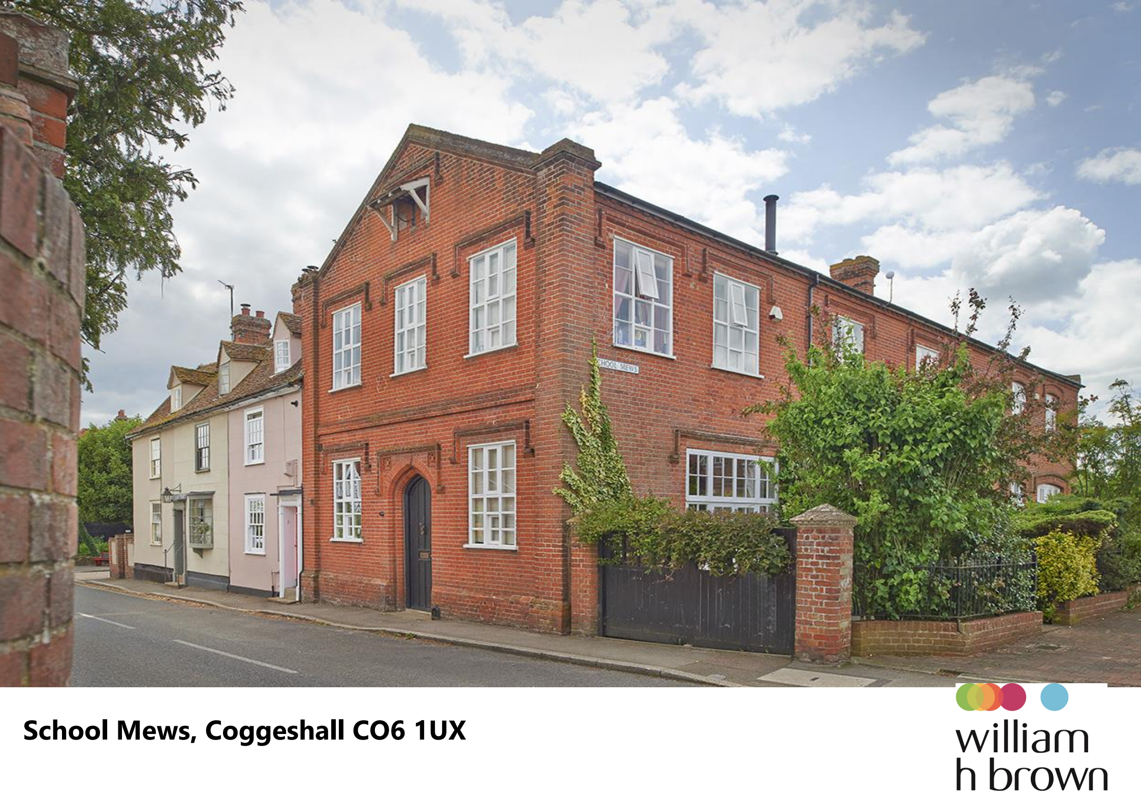
School Mews, Coggeshall CO6 1UX