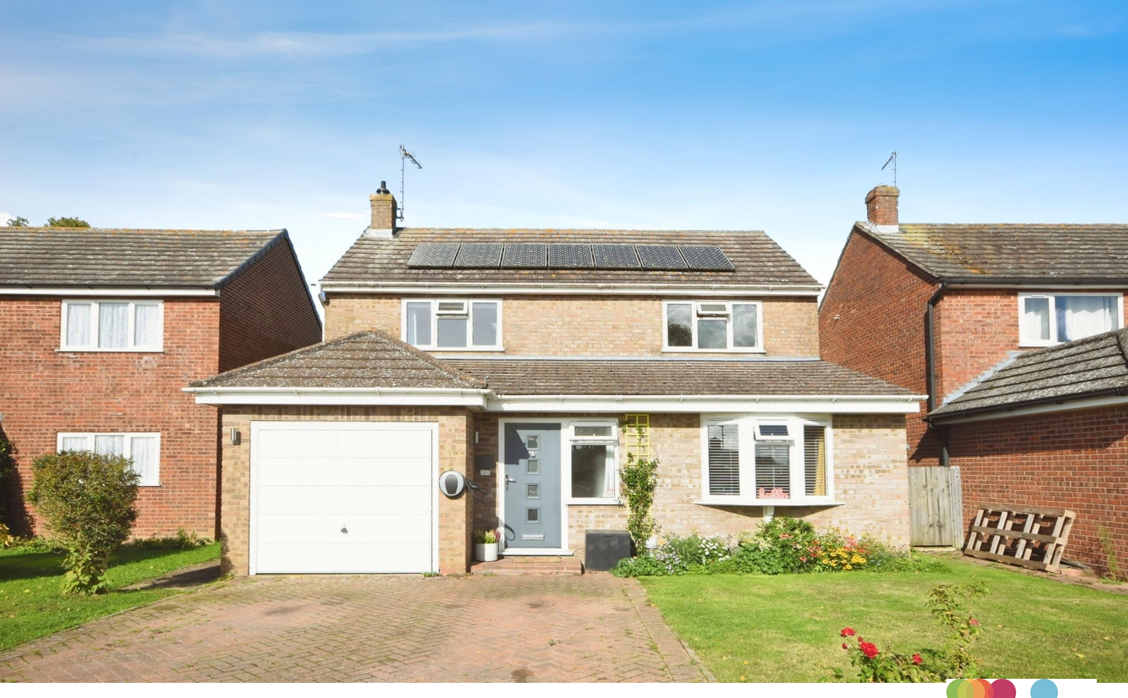
Chrismund Way, Great Tey CO6 1AZ