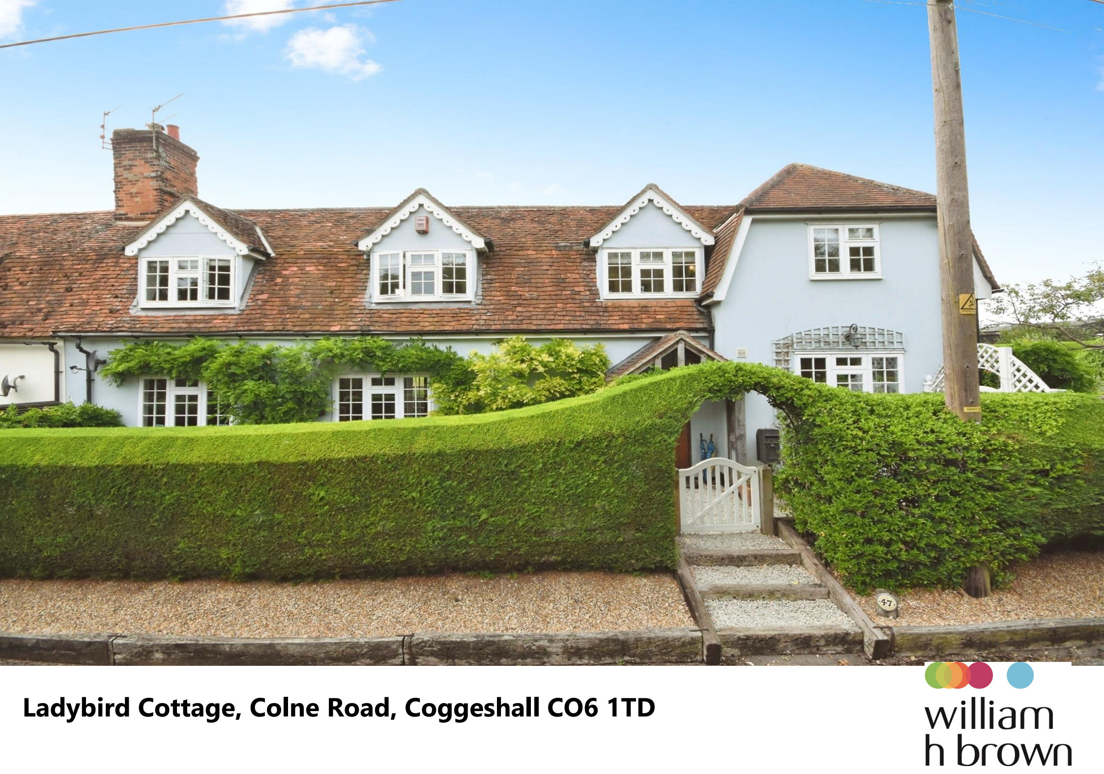
Ladybird Cottage, Colne Road, Coggeshall CO6 1TD