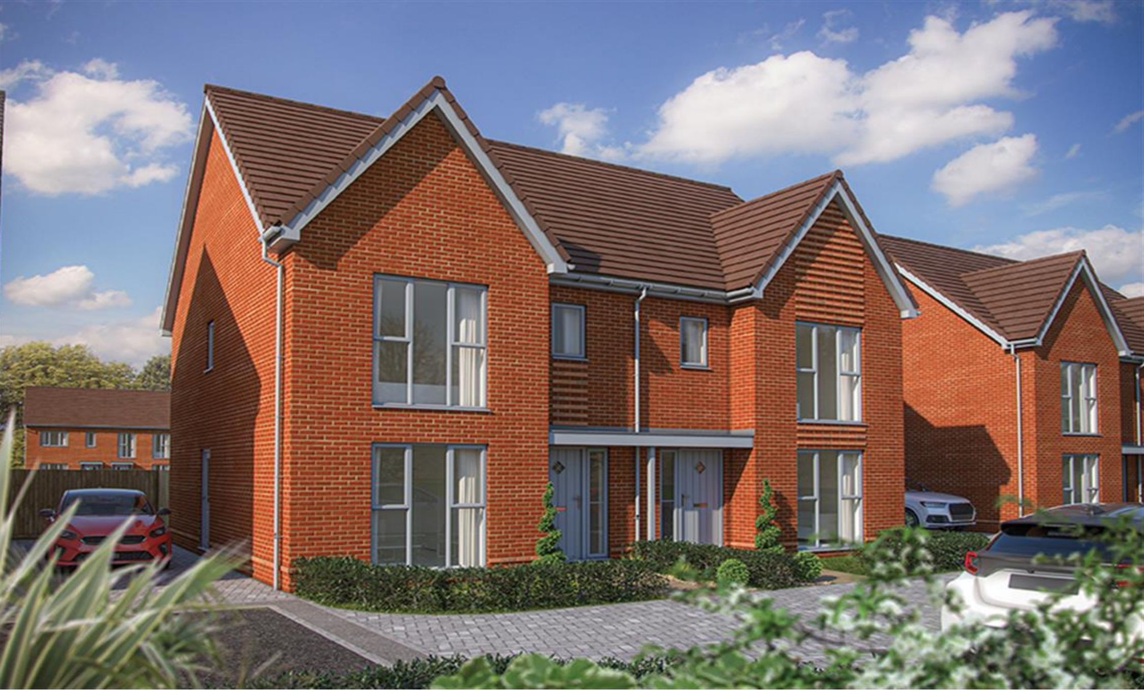
The Cypress, Coggeshall Mill, Coggeshall Colchester CO6 1RP