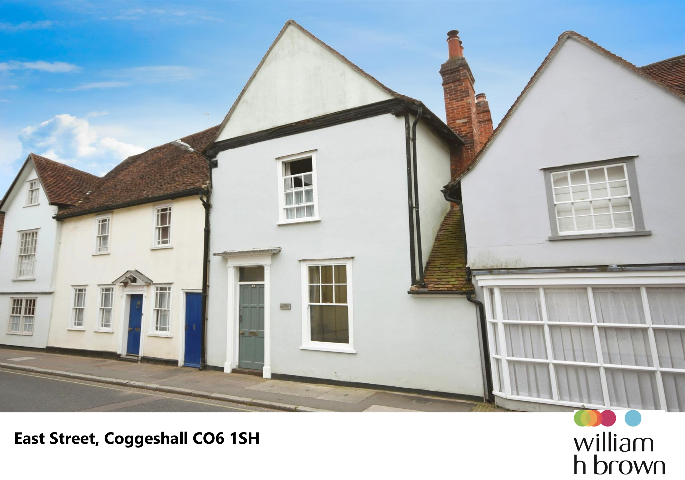
East Street, Coggeshall CO6 1SH