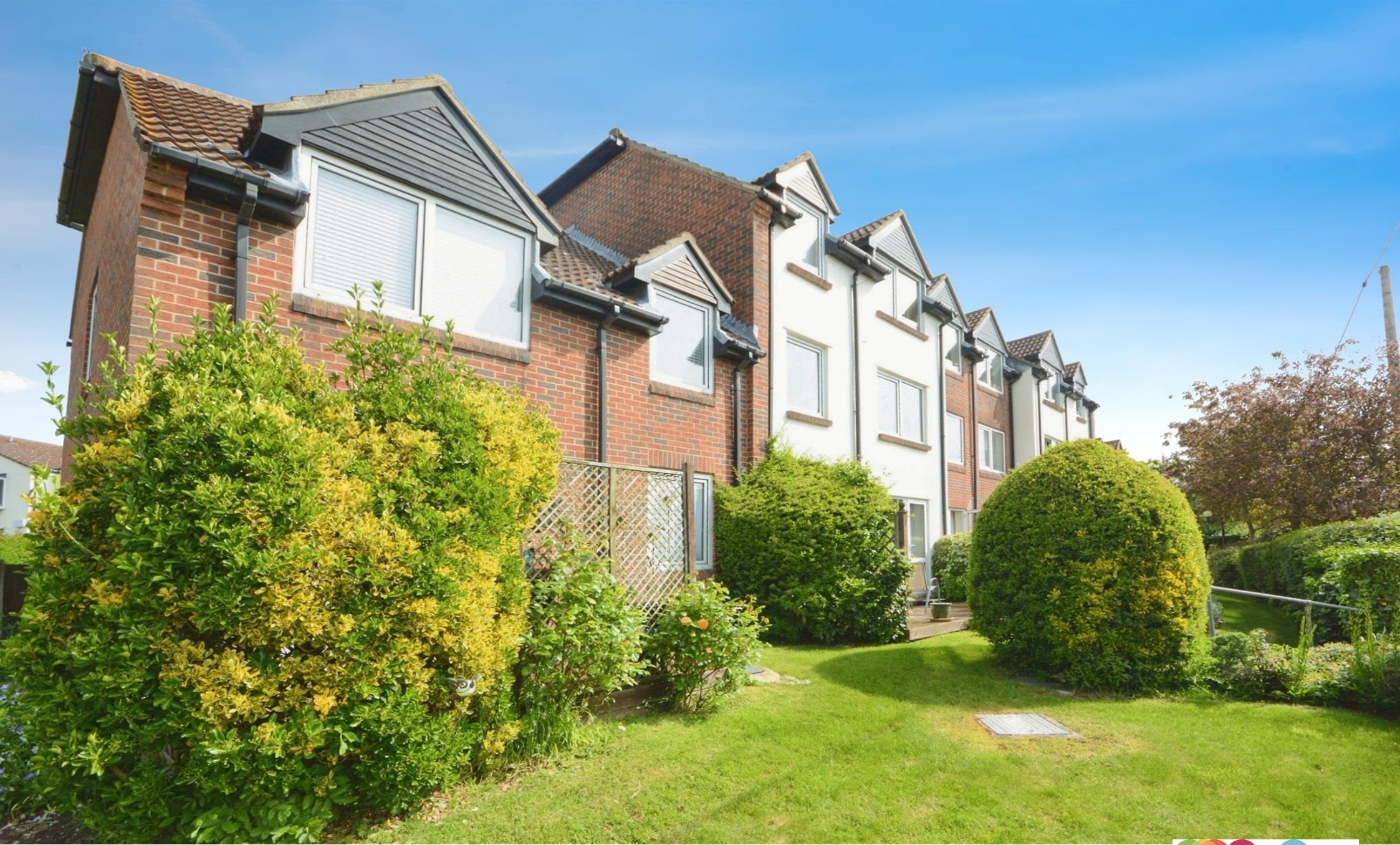
Homeweave House, Robinsbridge Road, Coggeshall CO6 1UL