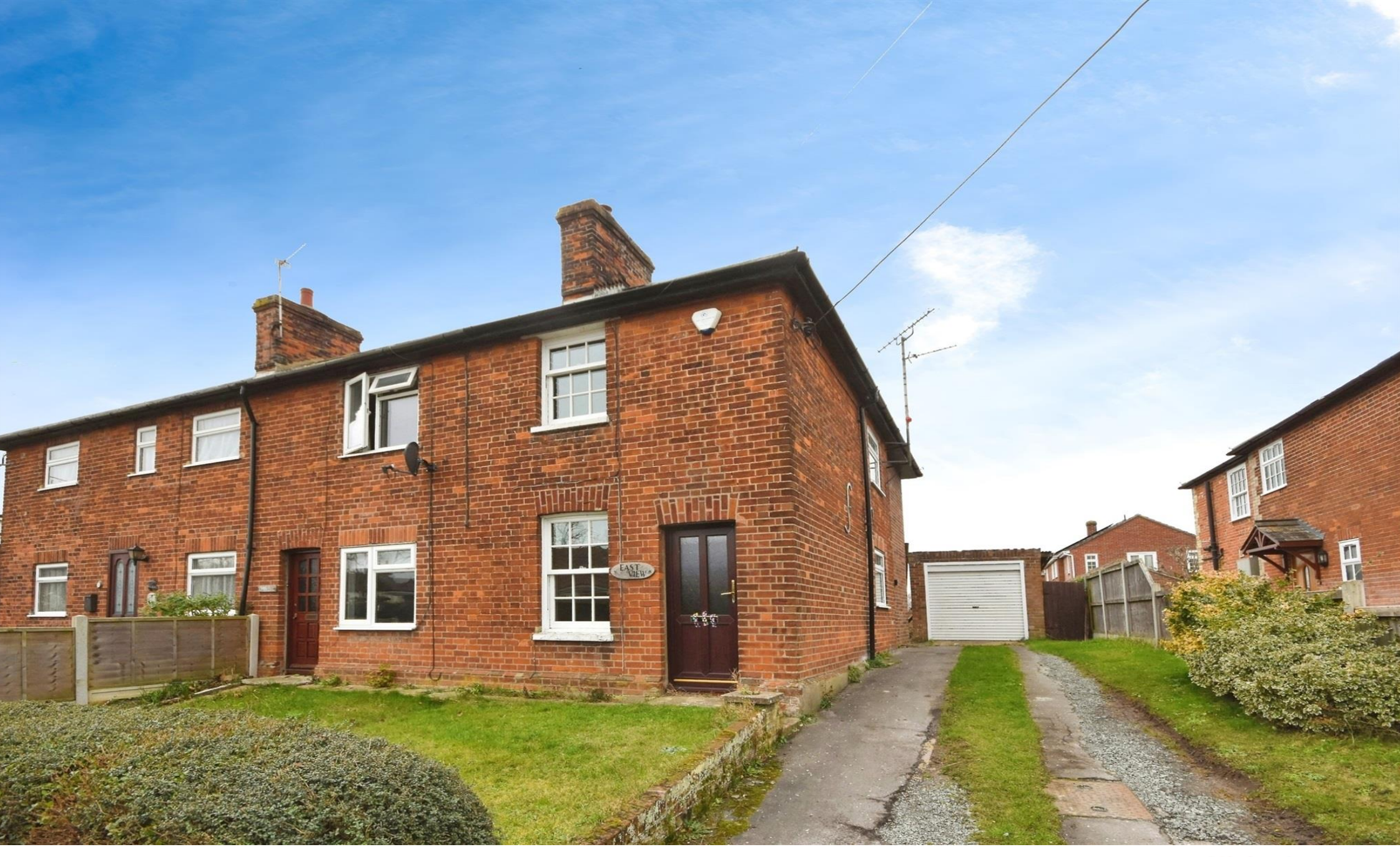
East View, Chappel Road, Great Tey CO6 1JQ