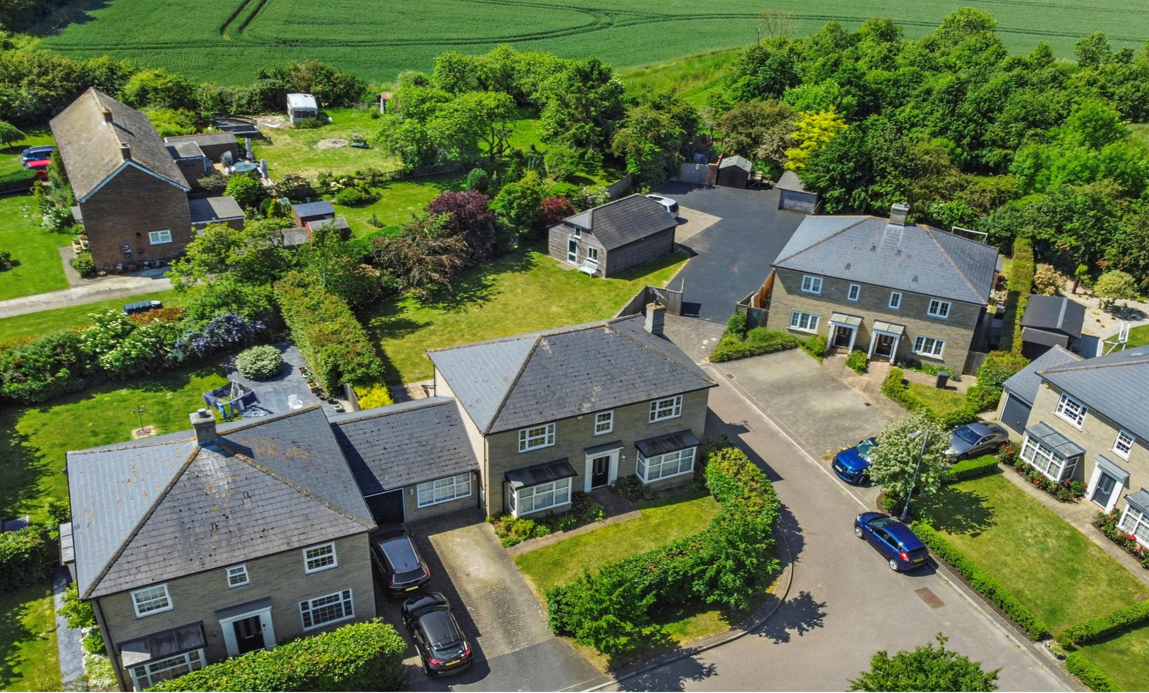
Prentice Place, Coggeshall CO6 1FH