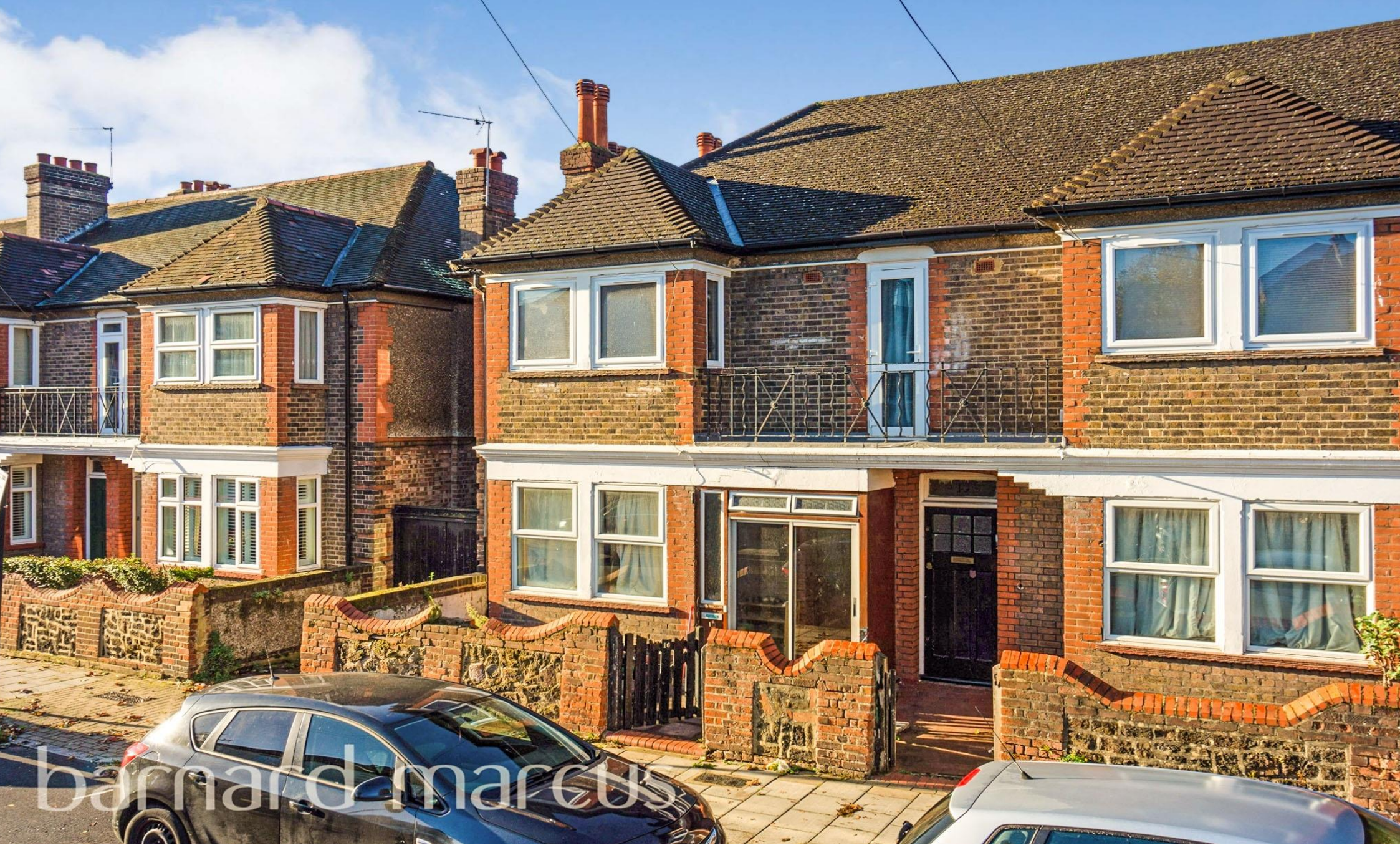
Beeches Road, London SW17 7LZ