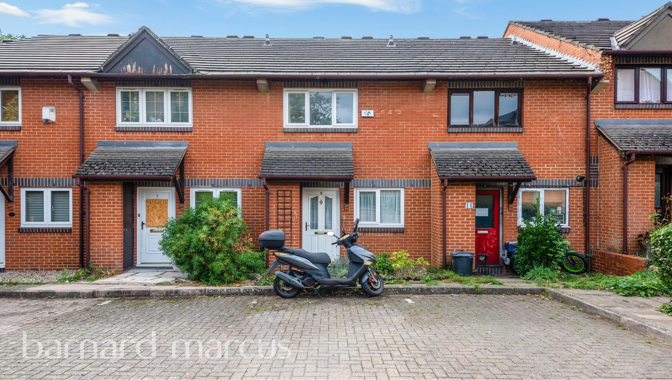
Carlisle Way, London SW17 9NZ