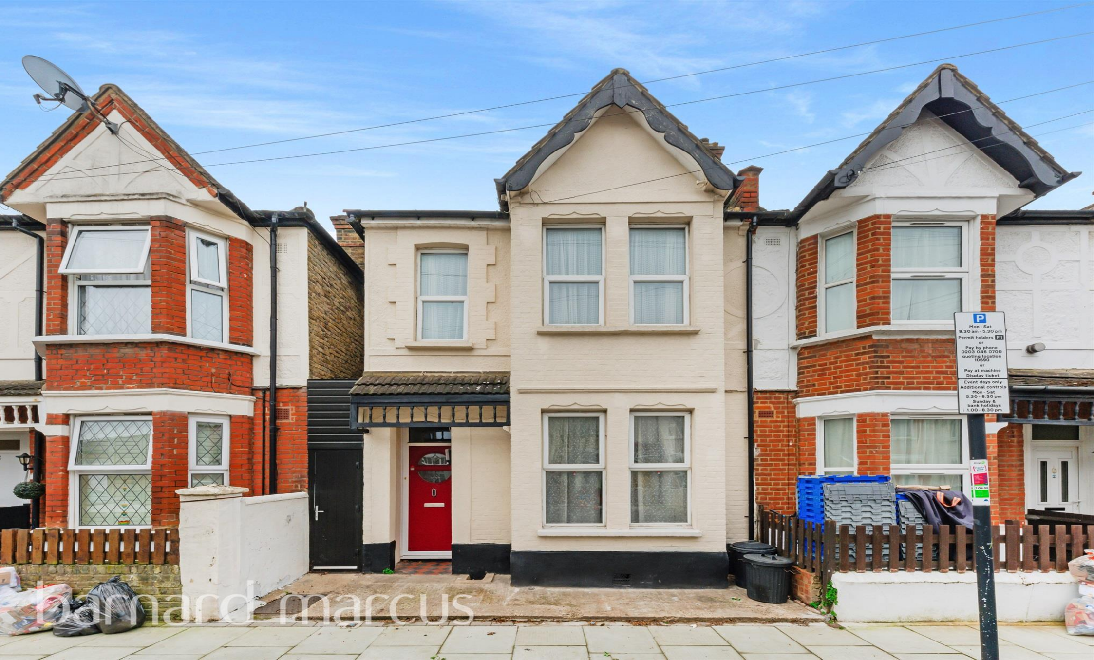
Thurso Street, London SW17 0HX