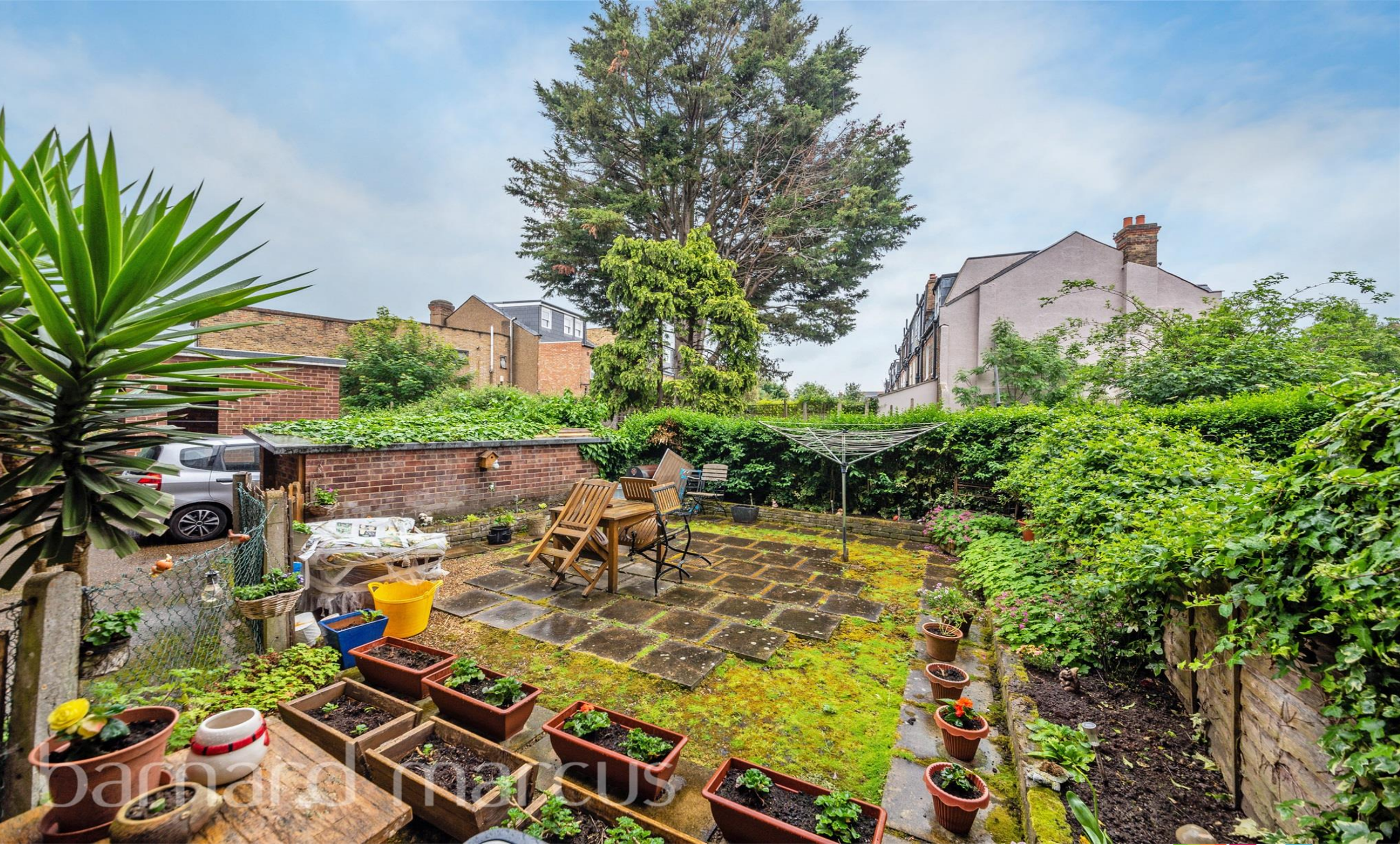
Burmester House Burmester Road, London SW17 0JL