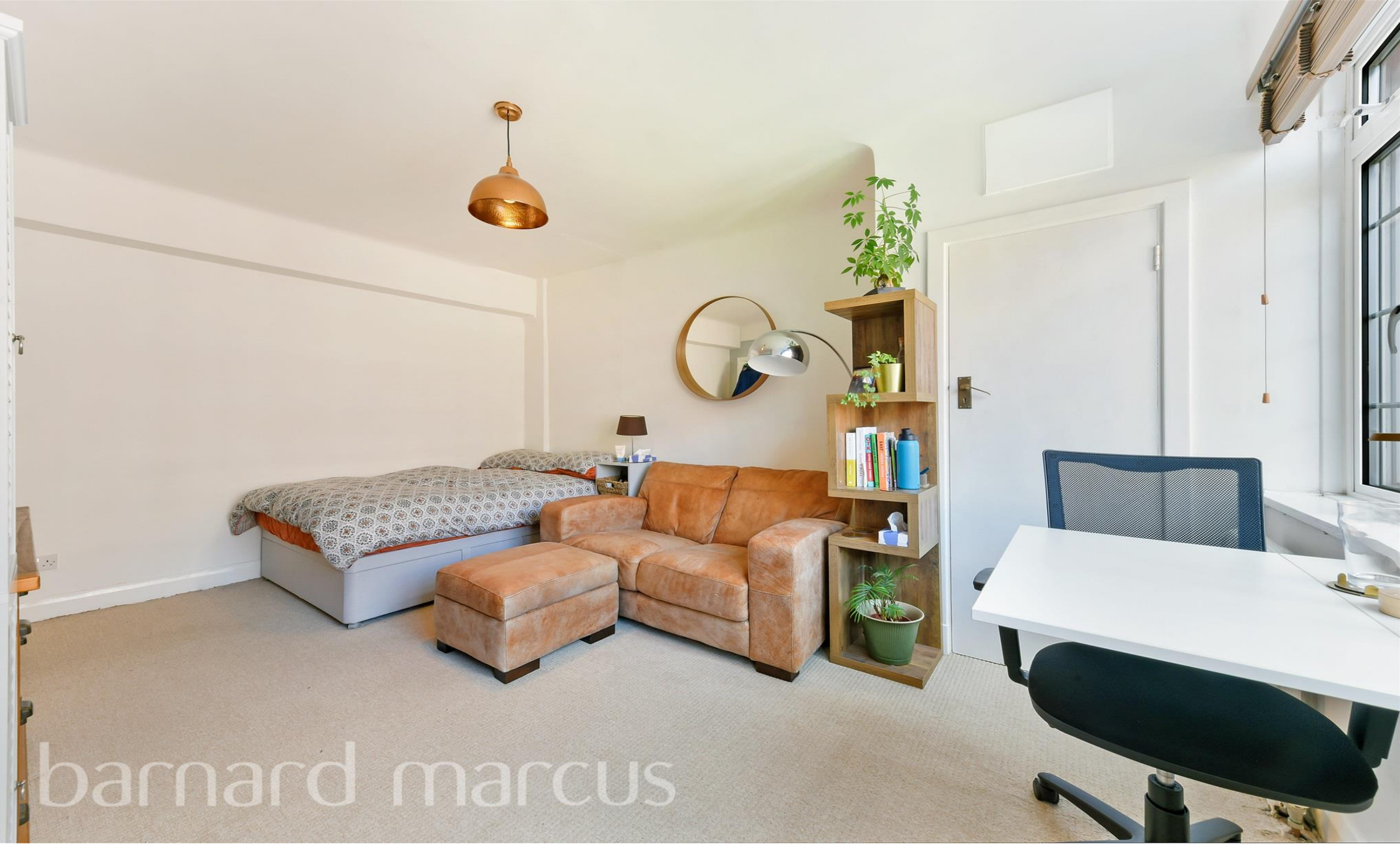
Du Cane Court Balham High Road, London SW17 7JT