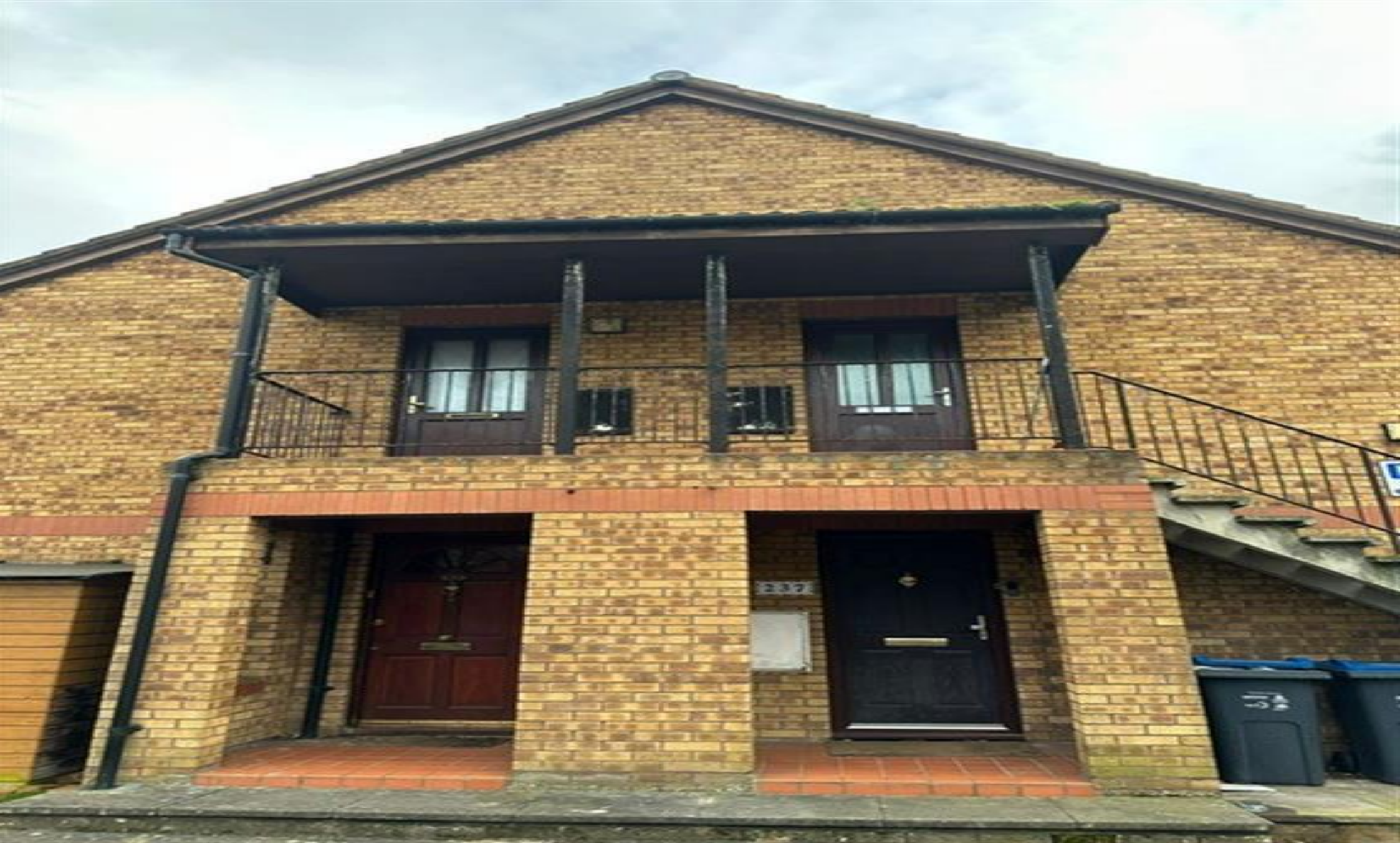
North Road, London SW19 1TP