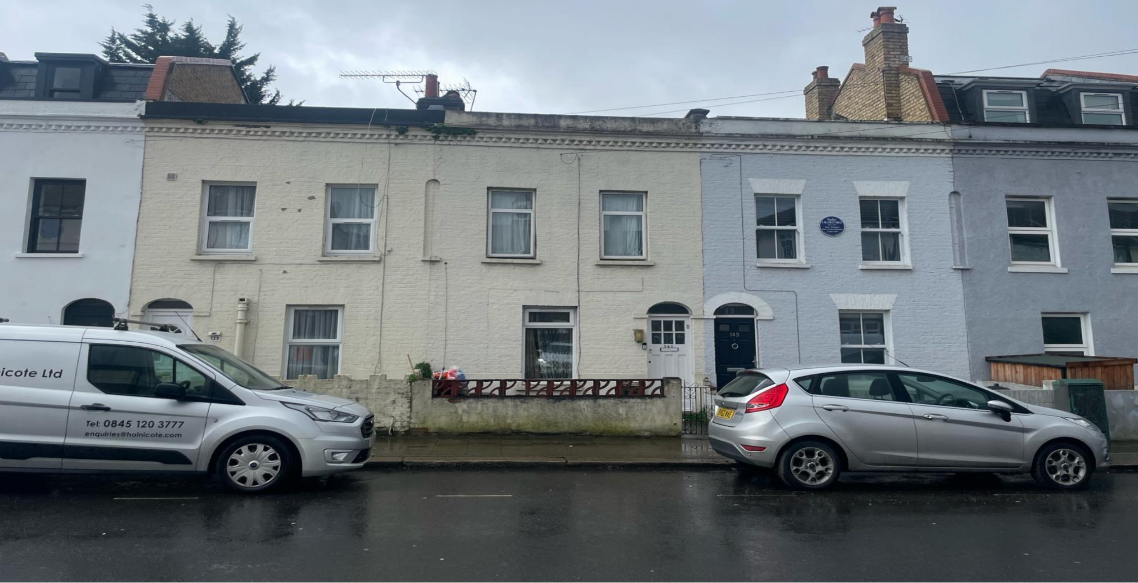
Fountain Road, London SW17 0HH