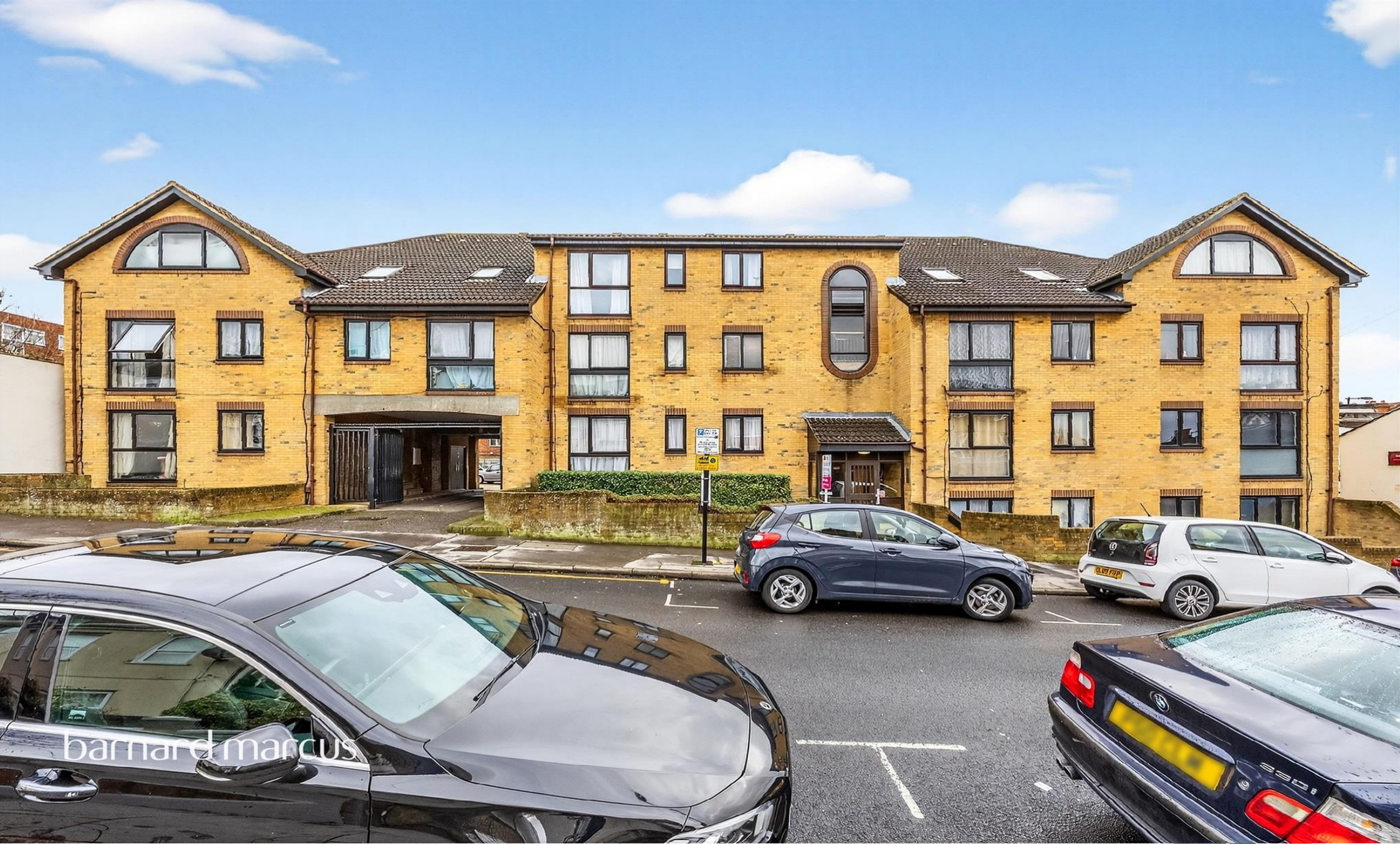
Palace Court, The Retreat, Thornton Heath CR7 8LD