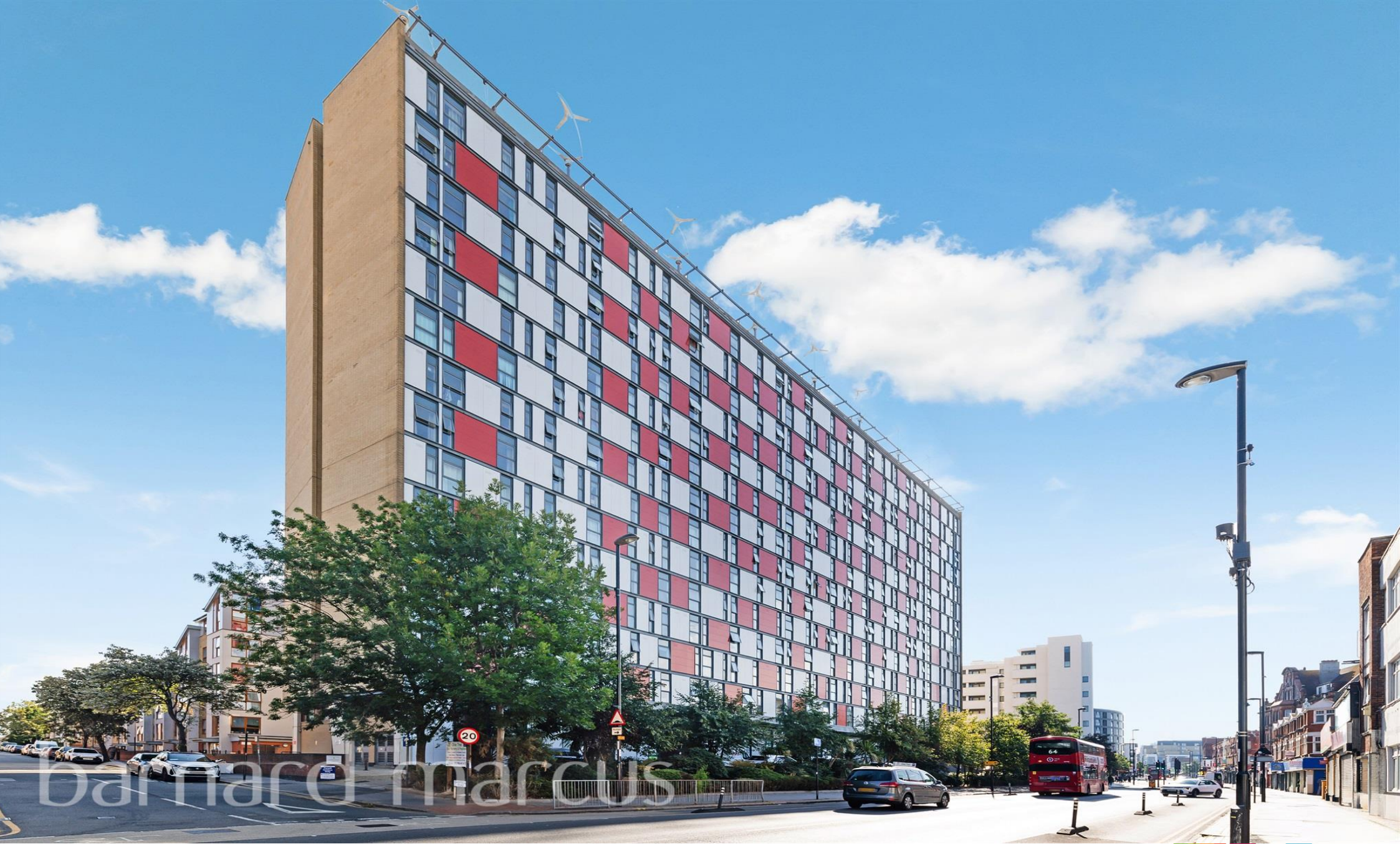
City House, London Road, Croydon CR0 2NS