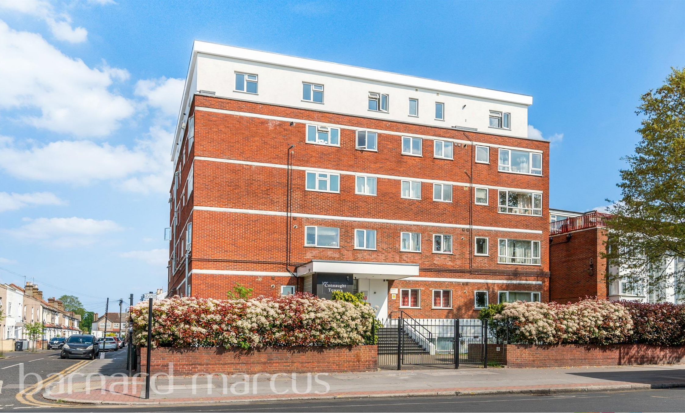
Connaught Towers, London Road, Thornton Heath CR7 7HU