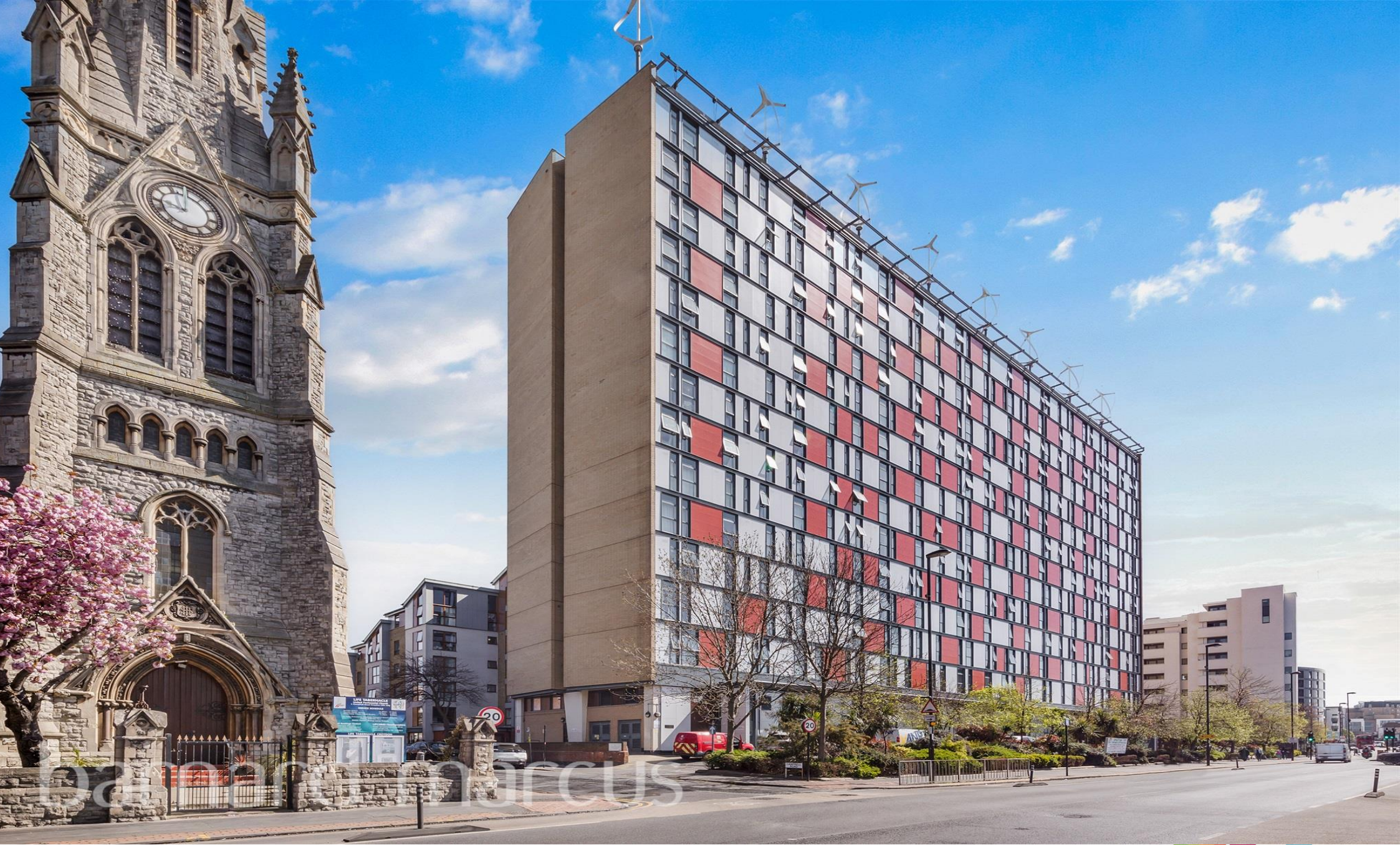
City House, London Road, Croydon CR0 2NT