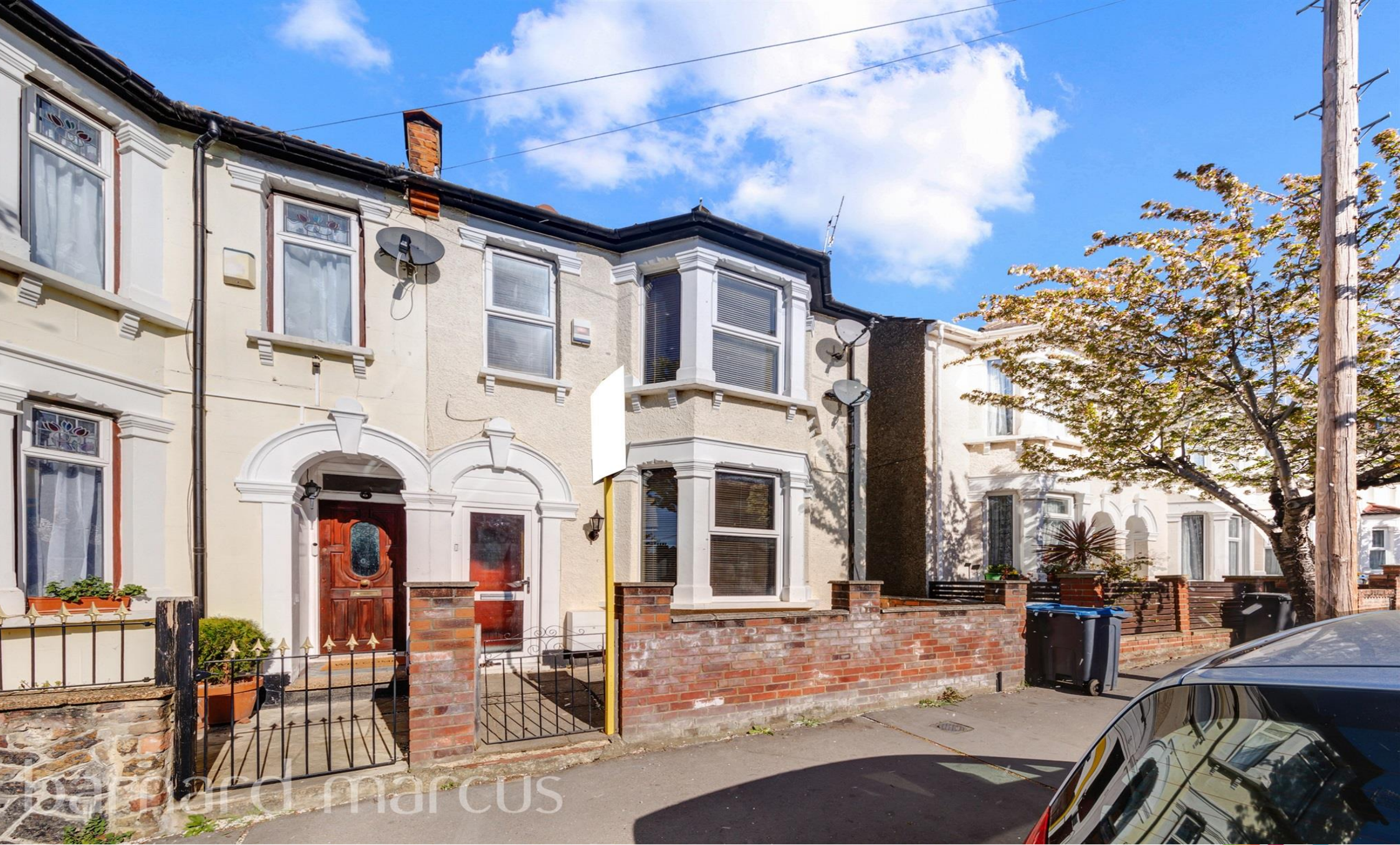
Fairholme Road, Croydon CR0 3PG