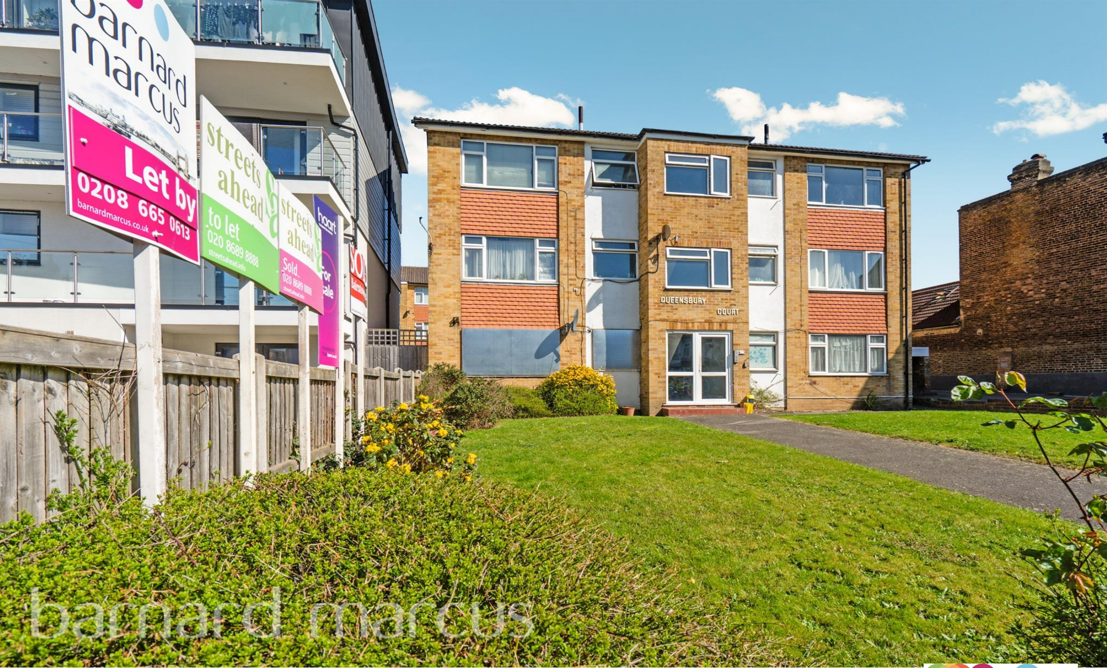
Queensbury Court, Parchmore Road, Thornton Heath CR7 8SL