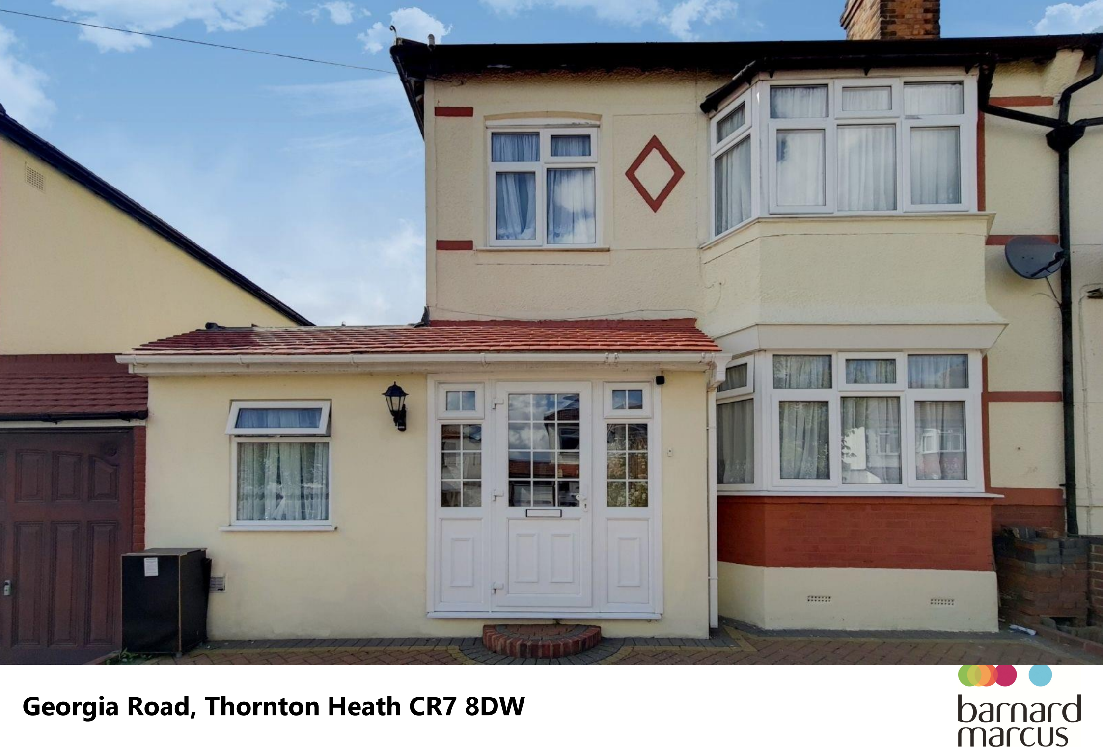
Georgia Road, Thornton Heath CR7 8DW