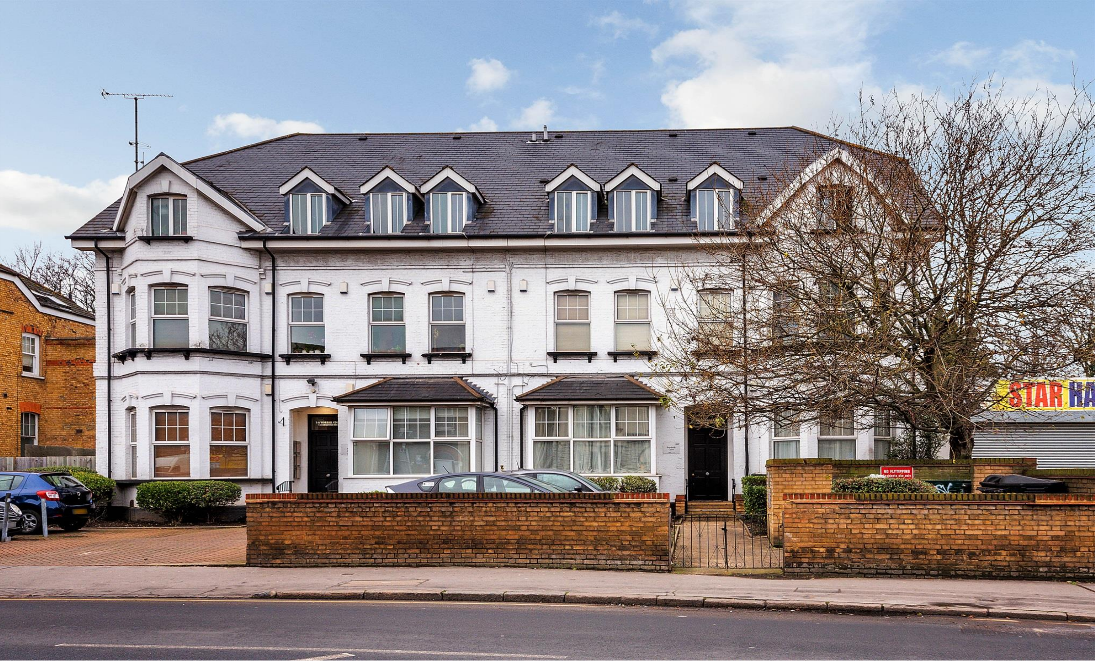
Brookside Court, Brigstock Road, Thornton Heath CR7 7JB